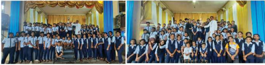
CBSE STATE KALOTSAV 2023, MARGAMKALI TEAM-A GRADE